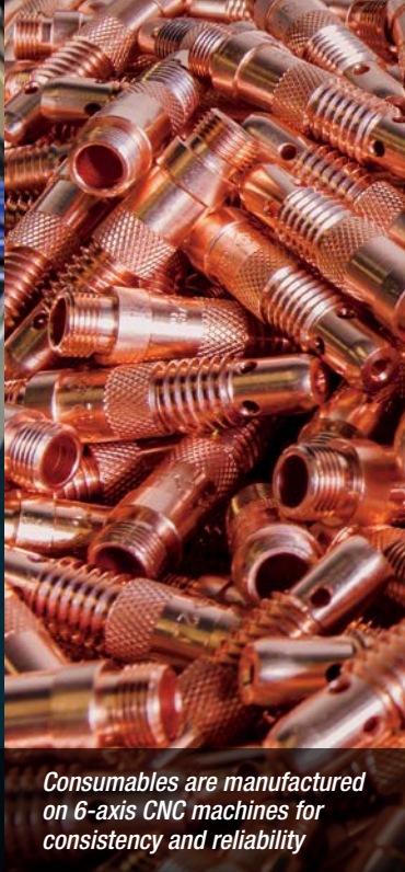
Consumables are manufactured on 6-axis CNC machines for consistency and reliability