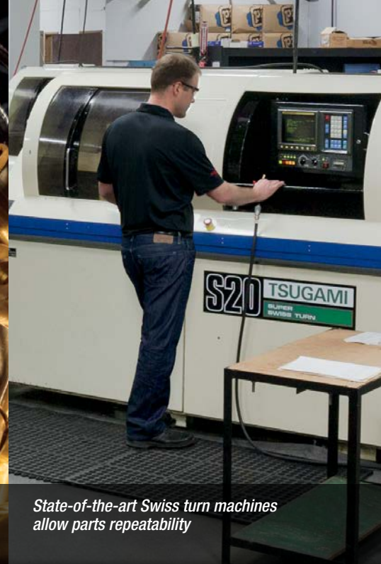
State-of-the-art Swiss turn machines allow parts repeatability