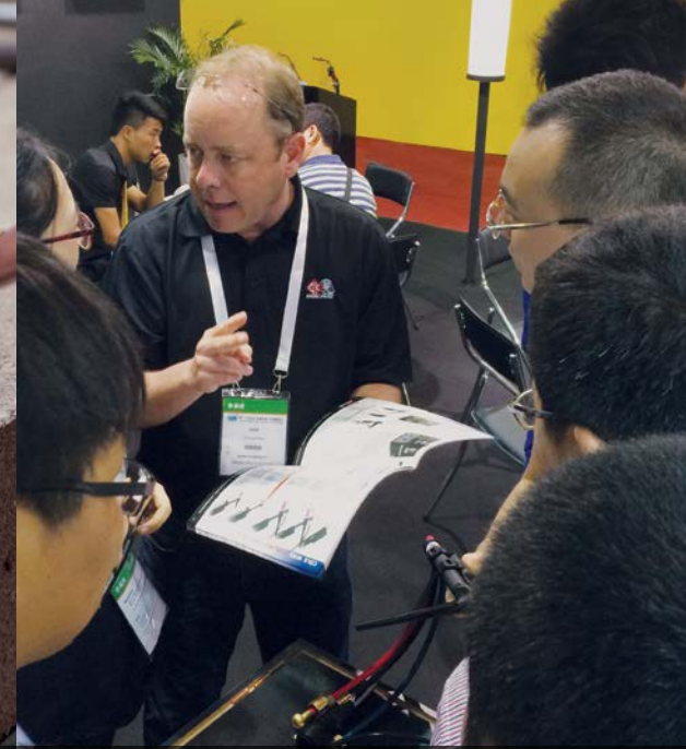
On-site customer learning sessions