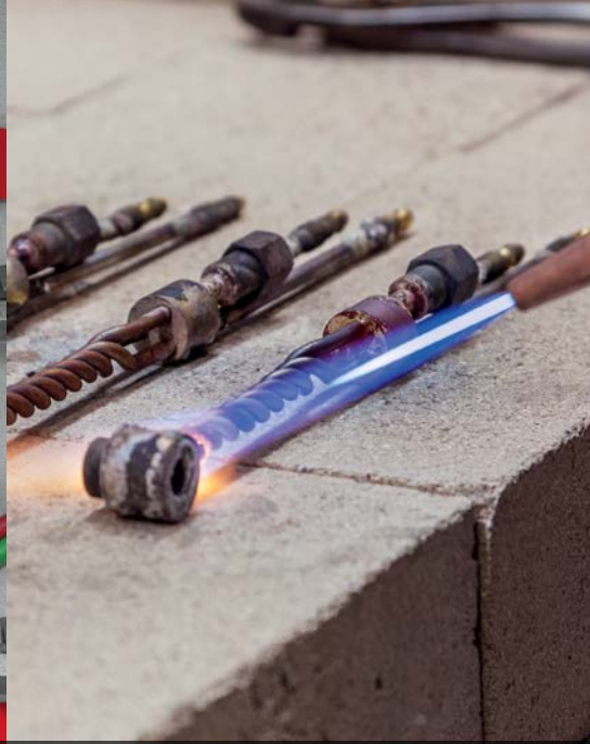
Torch-brazed assemblies use 45% silver