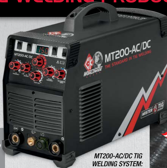
MT200-AC/DC TIG WELDING SYSTEM: Precision welding in a conveniently packaged system.