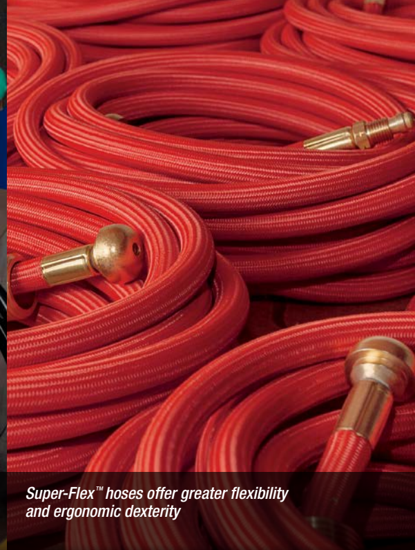
Super-Flex™ hoses offer greater flexibility and ergonomic dexterity