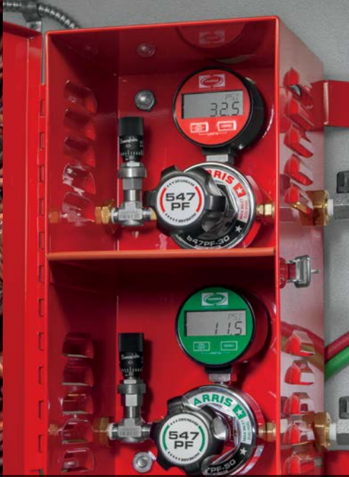
Digitally controlled gas regulation system allows consistent control of BTUs