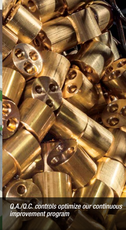
Q.A./Q.C. controls optimize our continuous improvement program