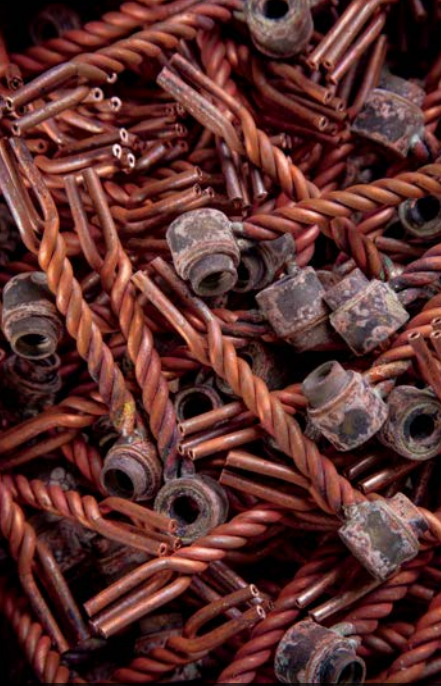
Torch components are checked for leaks prior to injection molding