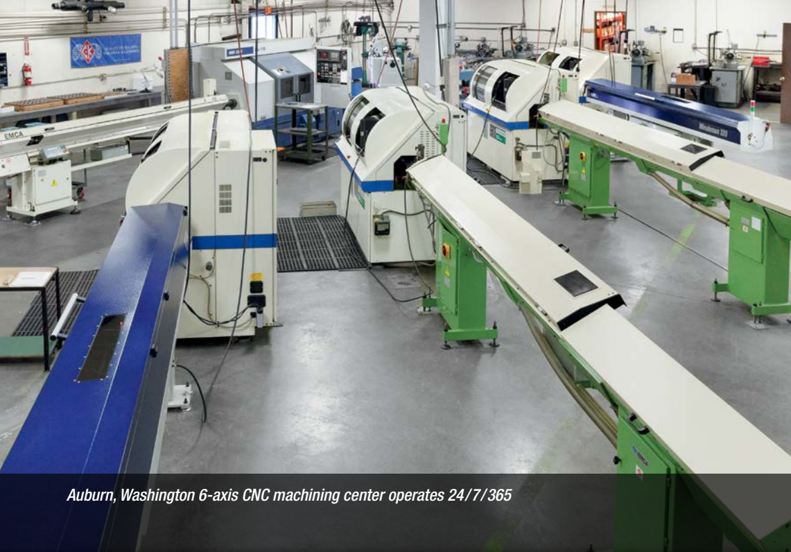
Auburn, Washington 6-axis CNC machining center operates 24/7/365