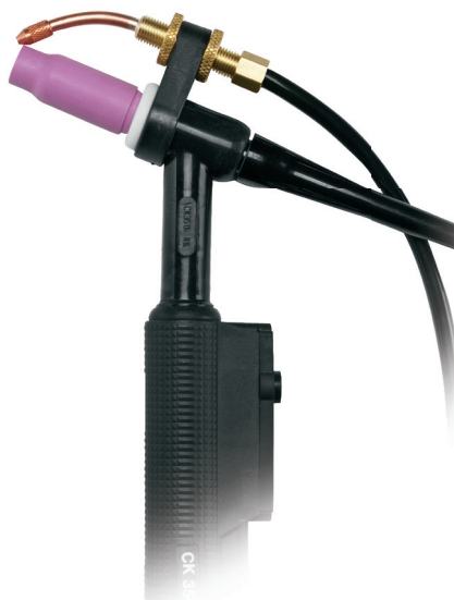
Head Mounted Wire Guide

Voltage.....115V AC (220V AC 50 Hz. - Special Item) Phase.....Single Phase Frequency.....50/60Hz. Height.....15 in. (38.1cm) Width.....10 in. (25.4cm) Length.....21 in. (53.3cm) Weight.....39 lbs. (17.7kg) Motor Type.....DC Permanent Magnet Motor Rating.....1/3 hp at 4000 rpm Filler Wire Spool Size.....10 in (25.4cm) or 12 in. (30.5cm) Filler Wire Sizes......023 in. (.5mm), .030 in. (.8mm), .035 in. (.9mm), .045 in. (1.1mm), 1/16 in. (1.6mm) Wire Feed Speed Range.....0-700 ipm (0-1775cm) Feed Time (pulsed mode).....continuously variable Dwell Time (pulsed mode).....continuously variable Delay Start Time.....continuously variable Wire Retract Time.....continuously variable