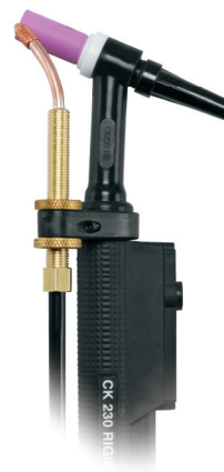
Body Mounted Wire Guide